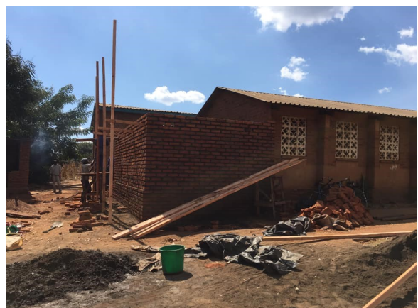
(Mwalaulomwe clinic renovations)